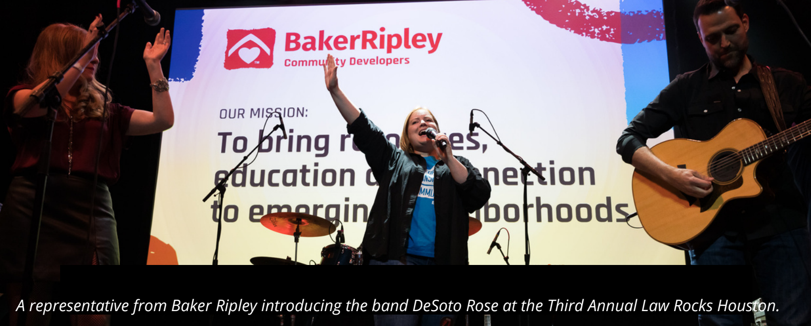
A representative from Baker Ripley introducing the band DeSoto Rose at the Third Annual Law Rocks Houston.